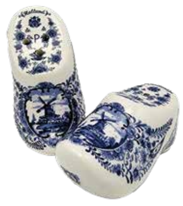
310036 Salt & Pepper Set 3.5" W $5.00