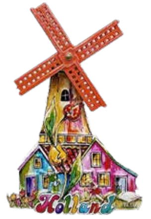
038844 Holland Windmill w/ Moving Blades 3.5" H $3.50