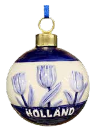
310926 Ball Ornament Tulips 2.5" W $5.00