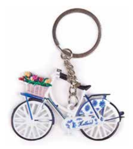
310430 Bicycle - Blue w/ Tulips $3.00