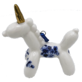
297411 Unicorn W/ Gold Horn 3" H x 3" W $6.00