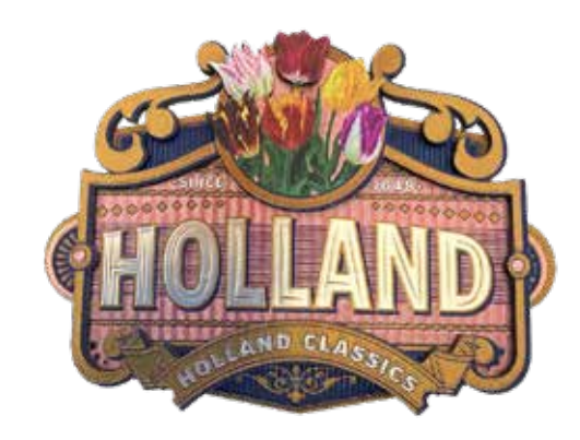
310007 Holland w/ Tulips 4" W x 3" H $2.50