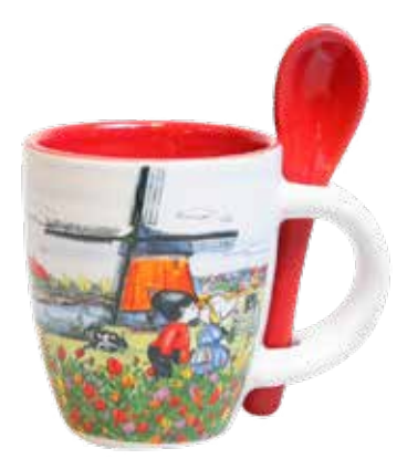
060183 Espresso Mug w/ Spoon $5.00