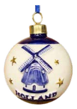
310921 Ball Ornament Windmill w/ Gold Stars 2.5" W $5.00