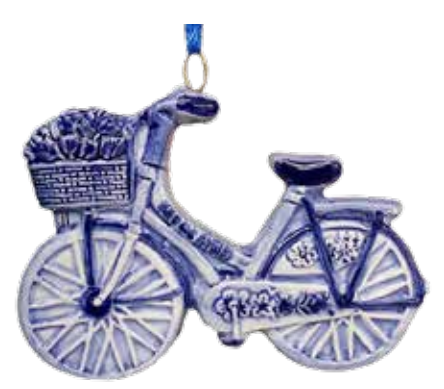
310937 Bicycle 3" W $5.00