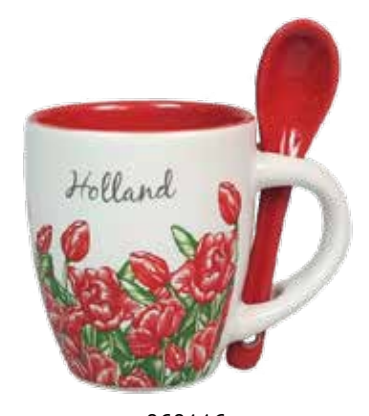
060116 Espresso Mug w/ Spoon $5.00