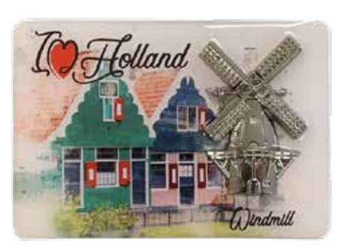
061016 3D Windmill 3.25" W x 2.25" H $2.50