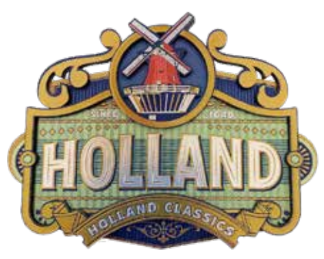
310001 Holland w/ Windmill 4" W x 3" H $2.50