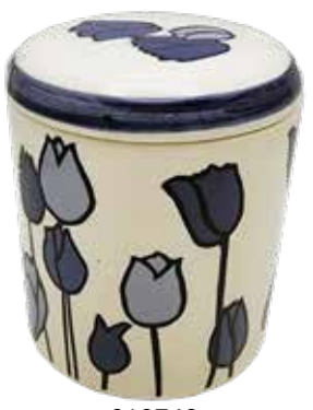
019740 Tulip Canister 4.75" H x 4" D $16.00