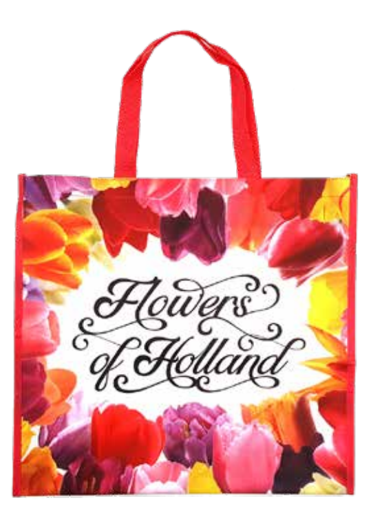
310383 Shopping Bag "Flowers of Holland" $4.00