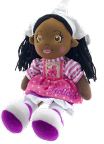
310896 Cuddle Doll Purple $8.50