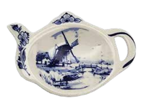
297410 Tea Bag Holder 4" W x 2.75" H $3.50