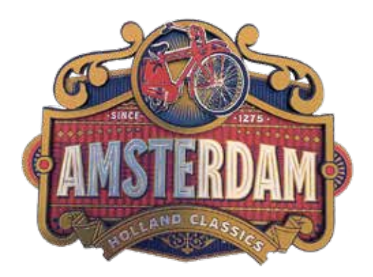
310002 Amsterdam w/ Bicycle 4" W x 3" H $2.50