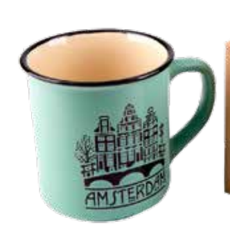
310592 Amsterdam Campfire Mug $6.00