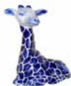
010732.12 Giraffe 3.75" H $33.00