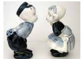
010566.12 Kissing Kids - 4.25" H $30.00