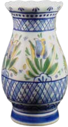
011839.13 5.75" H - Ribbed Vase $48.50