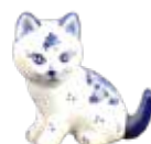
010690.12 Kitten - Asst'd $30.50