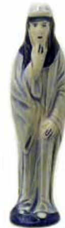
011479.12 Shepherd 6" H $22.00