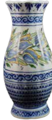
011841.13 7.5" H - Ribbed Vase $72.00