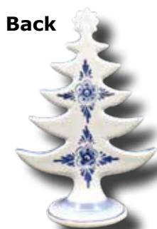
011490.11 Tree Topper 6" H $24.50