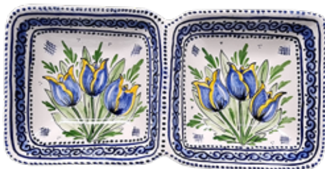
010931.13 Double Tapas Tray $70.00