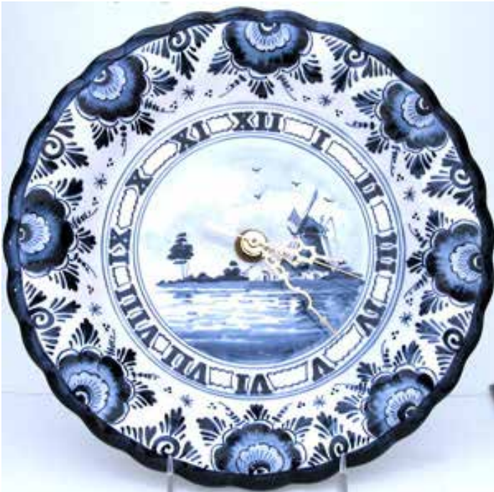
010775.11 10" Plate Clock $72.50