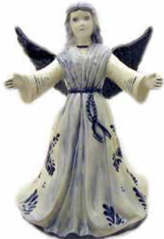
011489.12 Tree Topper 9.5" H $54.00