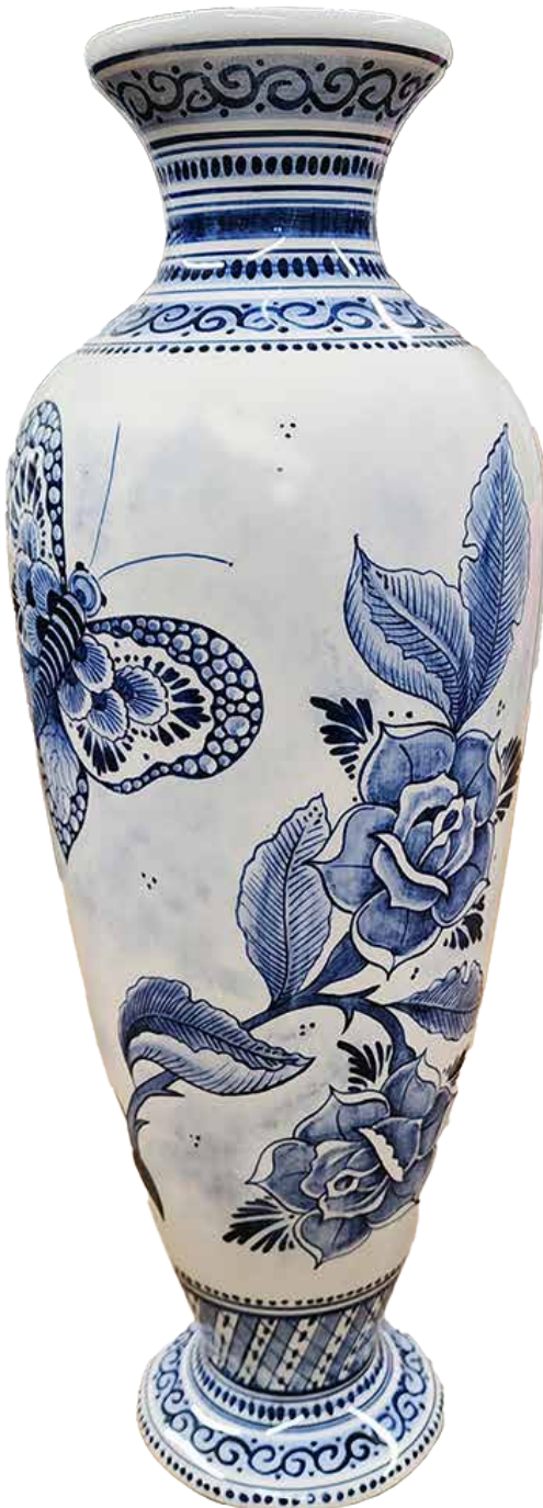
011460.13 Lg Amphora Vase $352.00