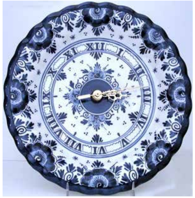
010775.12 10" Plate Clock $72.50