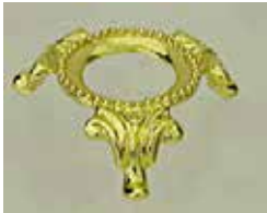
011710 5/8" H $5.00