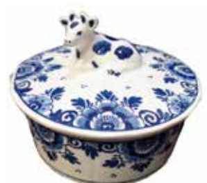
010515.12 Butter Dish - 4" D $41.00