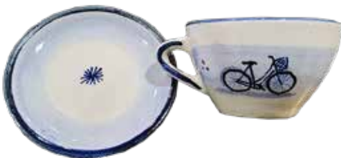
011776.14 Mini Cup & Saucer Bicycle $24.00