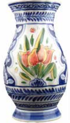
011841.23 7.5" H - Ribbed Vase $72.00