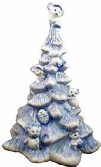
011450.12 Christmas Tree w/mice 15" H $95.50