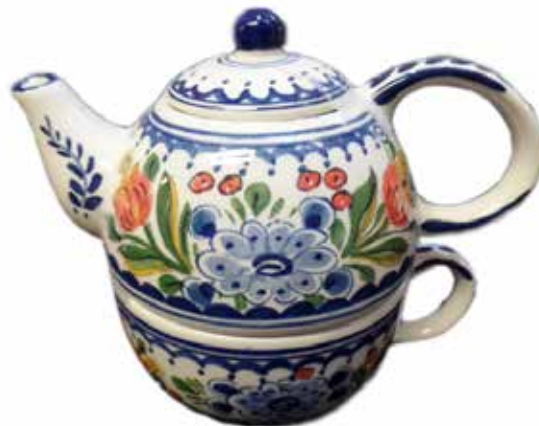
011420.23 Tea for One $96.00