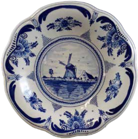
010404.11 12" Diameter - 2" Deep Plate $94.00