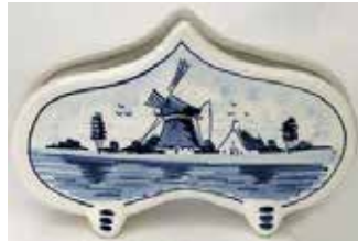
010549.11 Napkin Holder - 4.25" H $28.00