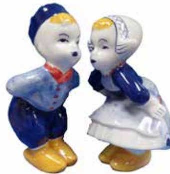
010565.13 Kissing Kids - 6.75" H $46.00