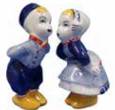
010566.13 Kissing Kids - 4.25" H $40.00