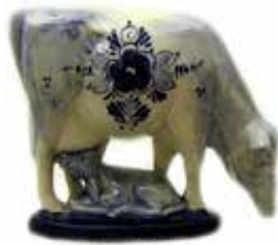
011466.12 Cow 3.5" H $24.00