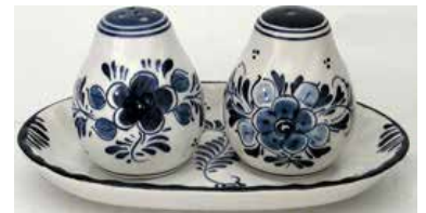
010562.12 Salt & Pepper - 3.25" H $31.00