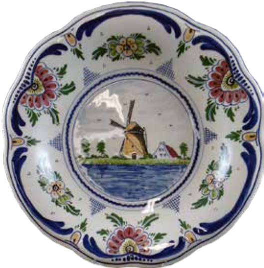
010404.21 12" Diameter - 2" Deep Plate $101.50