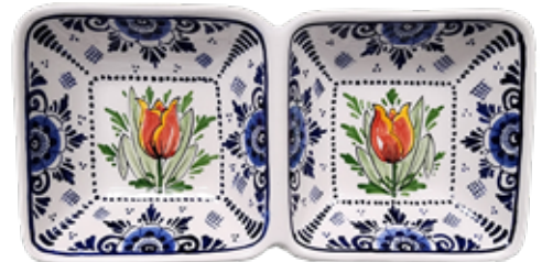
010931.23 Double Tapas Tray $70.00