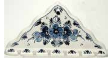
010568.12 Spoon Rack 7.75" L x 3.75" H $21.00