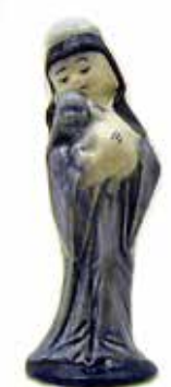
011480.12 Child Shepherd 4.25" H $22.00