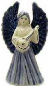
011544.12 4" H (asst) $26.50