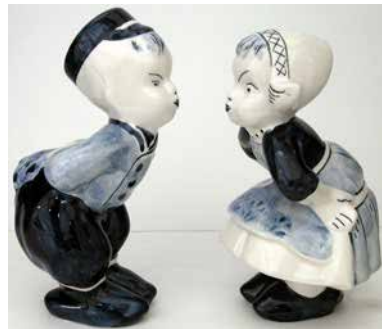
010565.12 Kissing Kids - 6.75" H $40.50