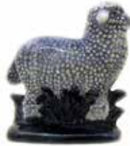
011467.12 Sheep 3" H $22.00