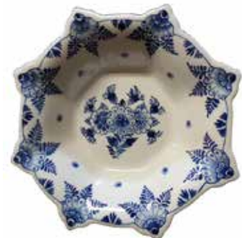
012909.42 7" Octagonal Dish $63.00