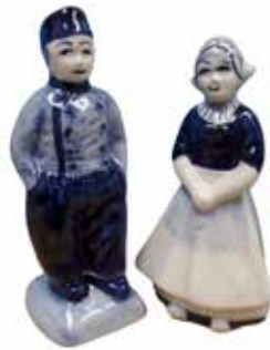
010558.12 Dutch Couple - 4" H $28.50