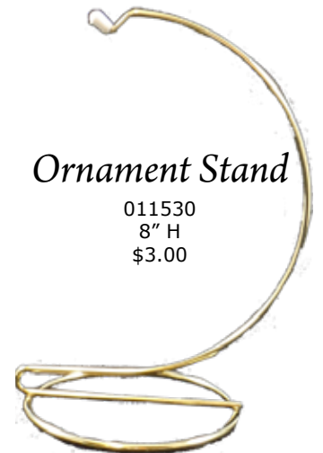
011530 8" H $3.00