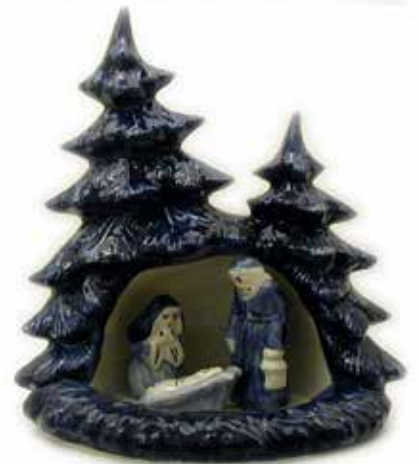
011605.12 Nativity in Tree 9" H $64.00