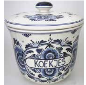
010902.1K 8" H $73.50