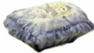
011472.12 Baby Jesus 3.25" W $22.00