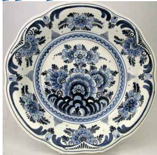
010404.12 12" Diameter - 2" Deep Plate $94.00