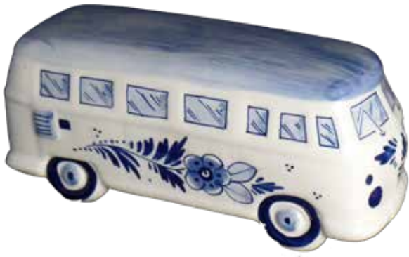
011481.12 VW Van $65.50