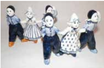
010563.12 Dancing Trio - 3" H $37.00