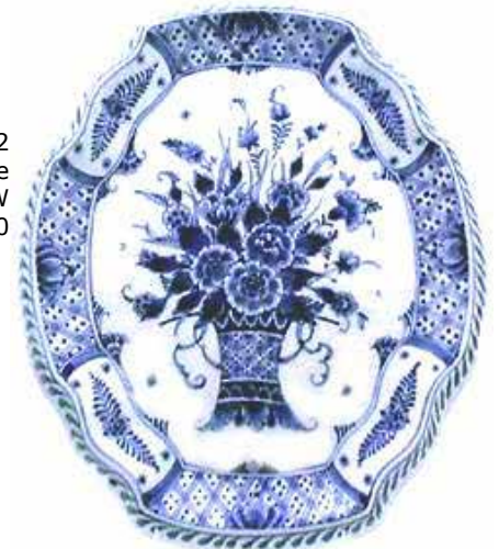
012046.42 Unica Applique 10.5" H x 8.75" W $193.00

Designs are handpainted and may vary from those pictured.