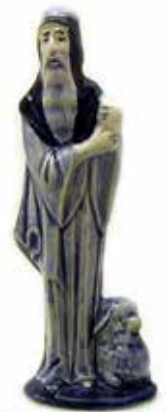
011474.12 Shepherd 6.25" H $26.50