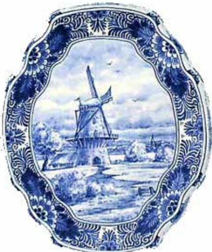
012046.41 Unica Applique 10.5" H x 8.75" W $193.00