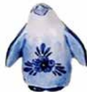
010714.12 Penguins, asst'd- 2.5" $14.00