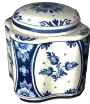
012502.42 Tea Canister 3.75" H $48.50