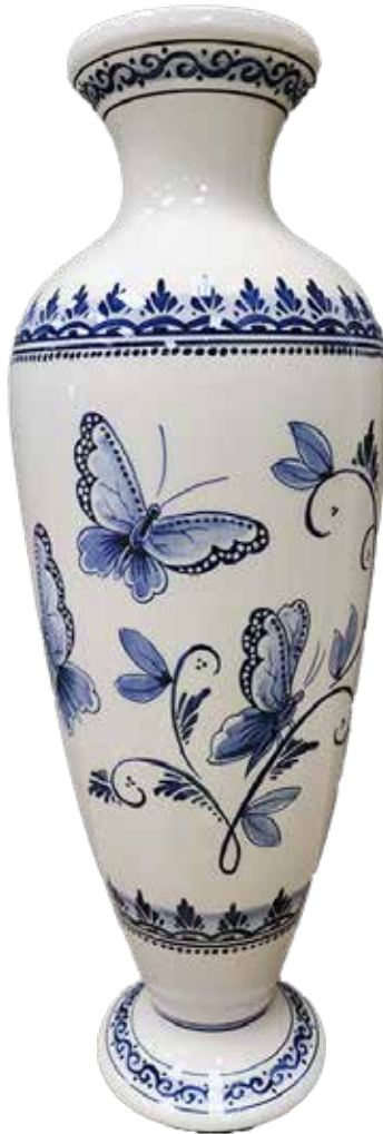
010776.13 Amphora Vase $260.50