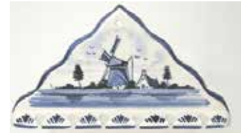
010568.11 Spoon Rack 7.75" L x 3.75" H $21.00