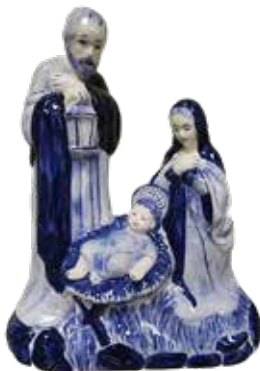
011443.12 Joseph & Mary $113.50