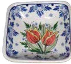
010930.23 Square Tapas Dish $40.00