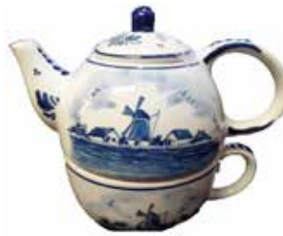
011420.41 Tea For One - 5" H $93.00