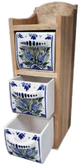
011490.13 Wood Rack w/3 Drawers $87.00