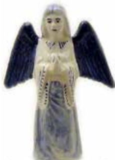
011471.12 Kneeling Angel 4" H $17.00