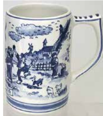
015246 5" H Dutch Way of Life Stein $18.50