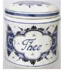
010511.1T 5" x 5" $38.50