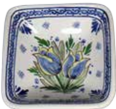
010930.13 Square Tapas Dish $40.00