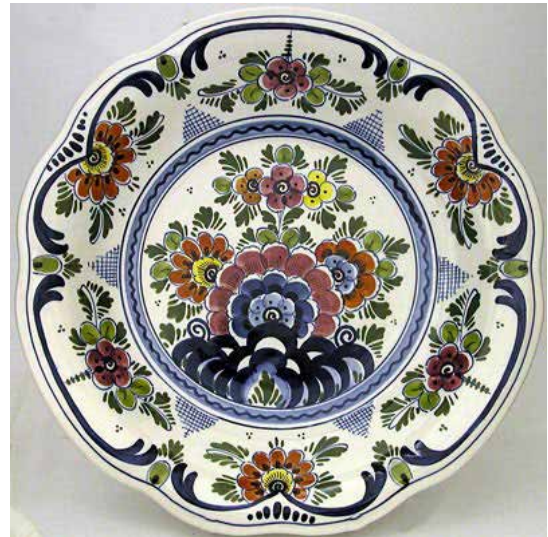
010404.22 12" Diameter - 2" Deep Plate $101.50