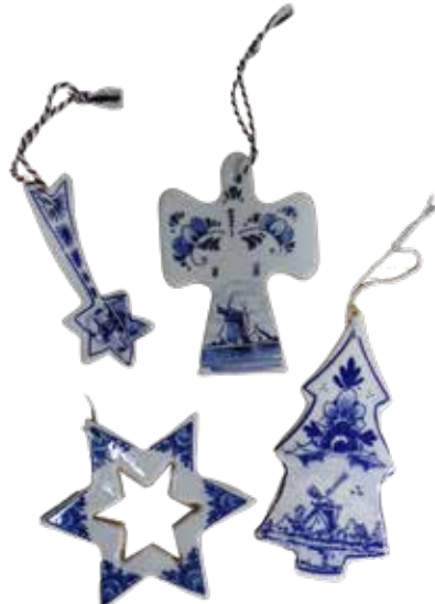
011530.12 Asst'd Flat Ornaments $5.00