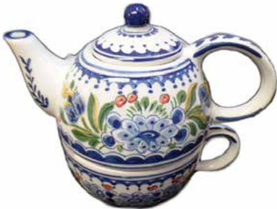
011420.13 Tea For One $96.00