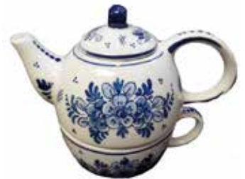
011420.42 Tea For One - 5" H $62.50