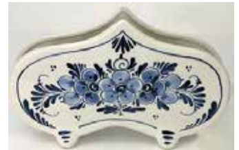
010549.12 Napkin Holder - 4.25" H $28.00