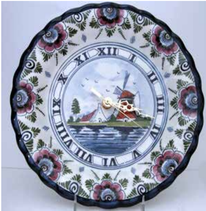
010775.21 10" Plate Clock $82.00