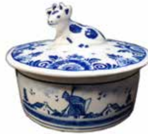
010515.11 Butter Dish - 4" D $41.00