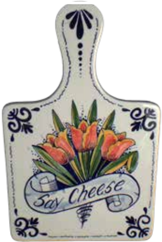
010900.13 Cheese Board $34.00