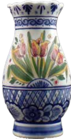
011839.23 5.75" H - Ribbed Vase $48.50