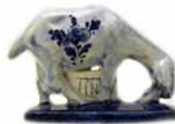
011468.12 Goat 2.5" H $22.00