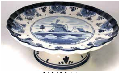
010406.11 6.25" W $34.00