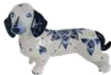
010792.12 Dachshund Dog $59.50