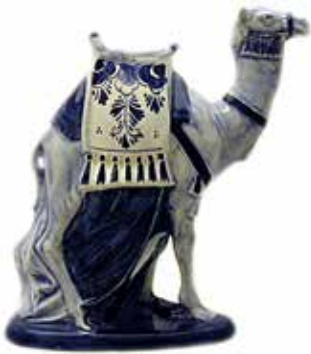
011465.12 Standing Camel 7" H $41.00