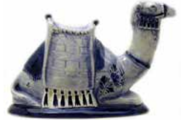
011469.12 Sitting Camel 4.25" H $34.00