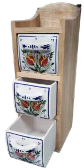
011490.23 Wood Rack w/3 Drawers $87.00