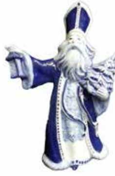
011488.42 Unica Piece 6.25" H $52.00