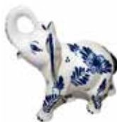
010583.12 Elephant 3" H $29.00