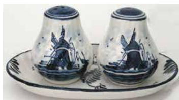
010562.11 Salt & Pepper - 3.25" H $31.00