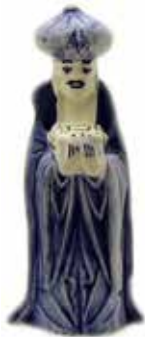
011476.12 Wiseman #3 4.75" H $24.00