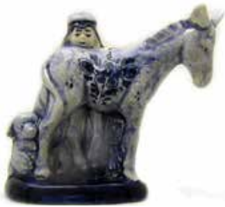
011470.12 Donkey 4" H $27.50